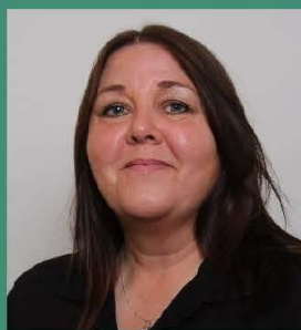
Shell Hammond Mental Health Lead