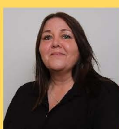
Shell Hammond Mental Health Lead